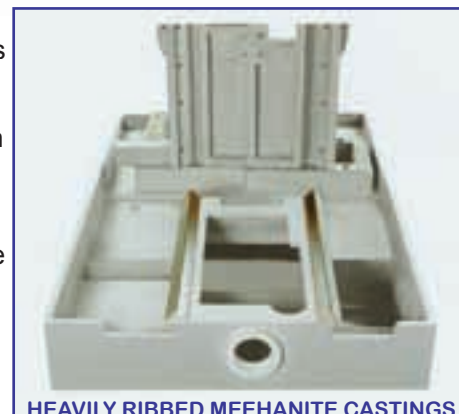
HEAVILY RIBBED MEEHANITE CASTINGS

Cincinnati Machines XG/Z-XG Series Centerless Grinders are designed and manufactured from the ground up to provide optimum quality, efficiency, and reliability. The heavily ribbed meehanite castings are combined with the standard outboard supports for both the grinding and regulating wheel spindles to insure maximum rigidity and stability. Add to that, the hydrostatic babbit type spindles, the automatic lube system, and a wide variety of available grinding accessories, and you have one very versatile, reliable, and efficient centerless grinder.