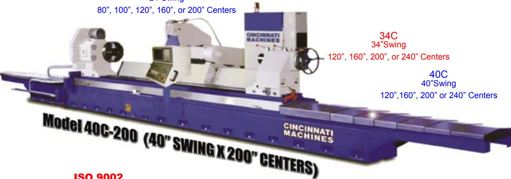
Model 40C-200 (40" SWING X 200" CENTERS)

40C 40" Swing 120", 160", 200" or 240" Centers